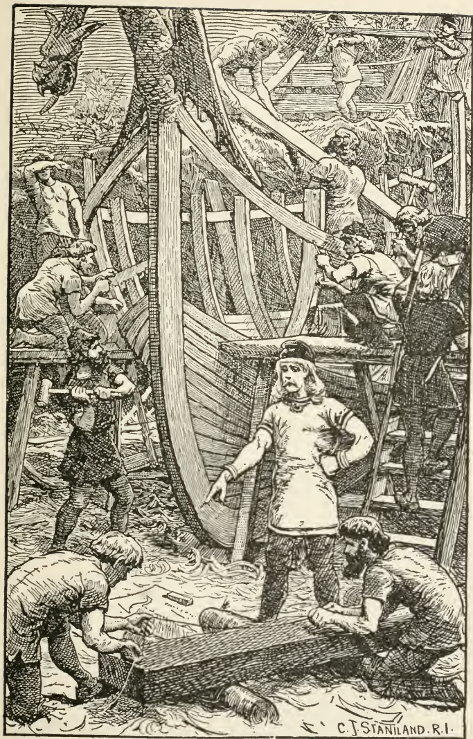
The building of the Dragon.—Page 71.